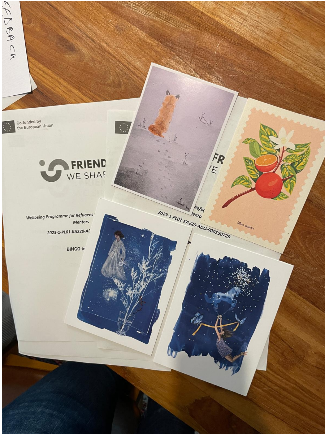
“Friends We Share – Wellbeing Programme for Refugees with Role Models and Mentors ”, Erasmus + project nr 2023-1-PL01-KA220-ADU-000150729.